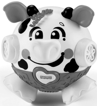
Bounce and Giggle™ Cow G8370

Please keep this instruction sheet for future reference, as it contains important information.