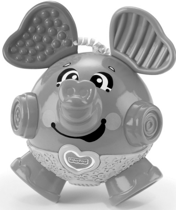
Bounce and Giggle™ Elephant G6683