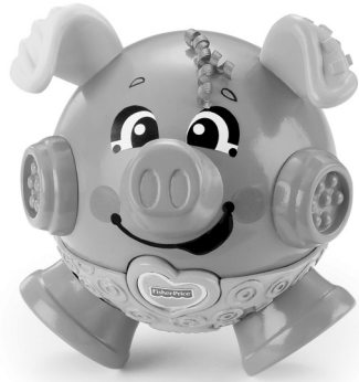
Bounce and Giggle™ Pig G6684