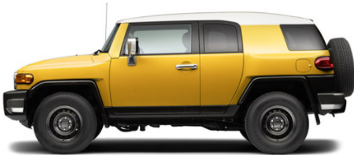
4x4 5-Speed Auto (4704) MSRP** Starting At: $23,500.00