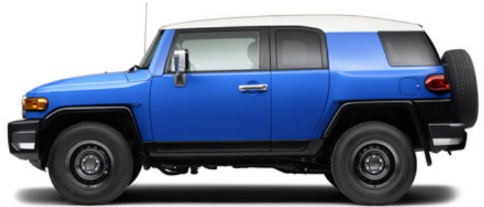
4x4 5-Speed Manual (4703) MSRP** Starting At: $23,090.00