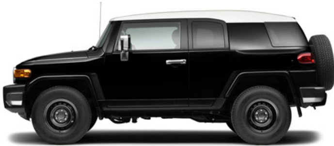
4x2 5-Speed Auto (4702) MSRP** Starting At: $21,910.00