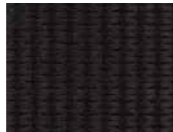
Slate Gray Cloth (SGC)