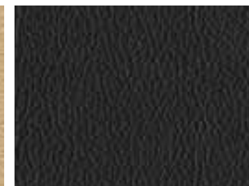
Slate Gray Leather (SGL)