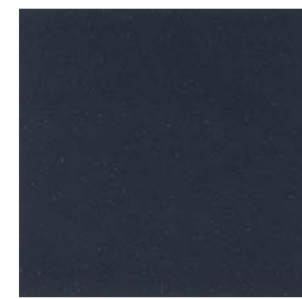
Dark Gray Metallic