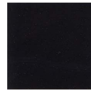
Obsidian Black Pearl