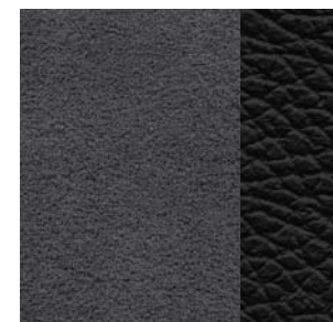
Graphite Gray Alcantara ® / Carbon Black Leather (GGA)