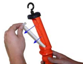
STEP 2. Pull bulbs effortlessly forward to a 30° angle and remove top silicon bulb holder.