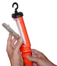
STEP 1. Take off lens by removing side screws.