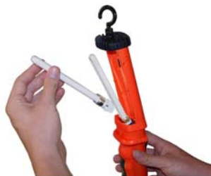
STEP 3. Easily remove old bulb and replace with new bulb. Replace top bulb holder, push bulbs back in the case and close lens to finish!