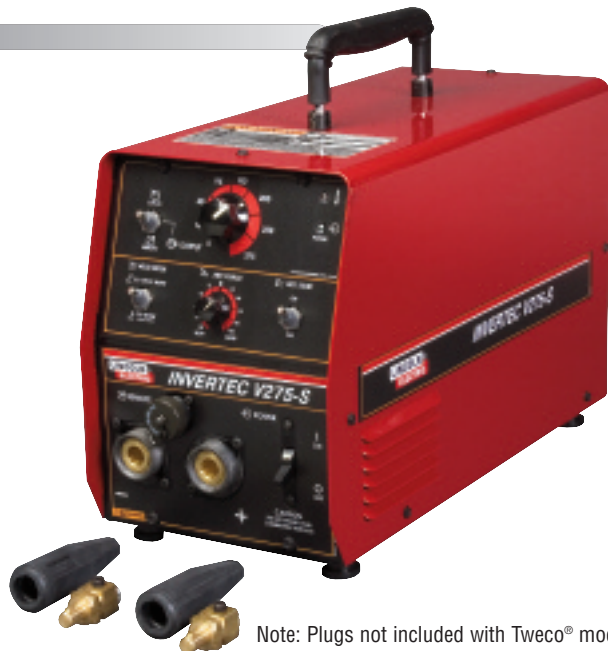
Note: Plugs not included with Tweco® model.