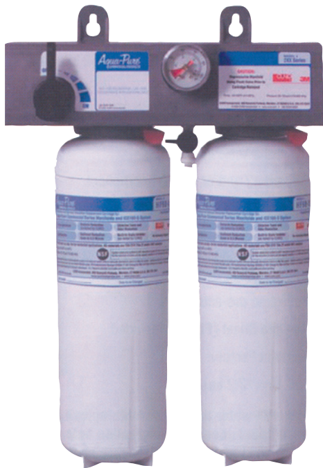
Model EQHP-TWIN 70L Water Quality System