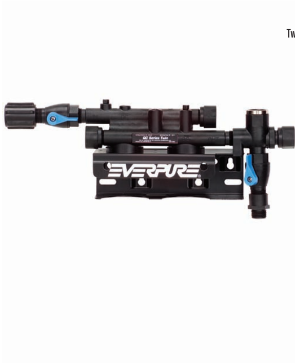
Twin Series Head: EV9272-24

Series filter head exclusively for Everpure replacement cartridges