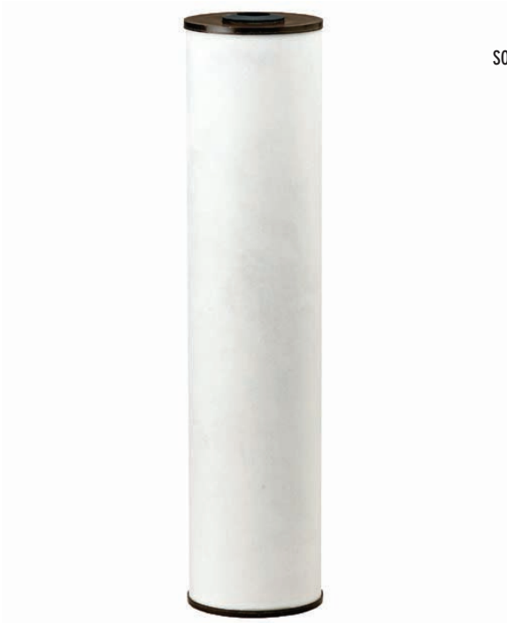
SO-204 Softening Cartridge: DEV9105-45