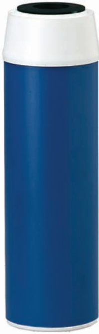
CGT-10 Replacement Cartridge: DEV9108-11