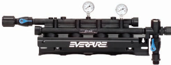
QC7I Quad Parallel Head: EV9336-11

Filter head exclusively for Everpure replacement cartridges