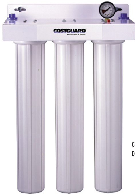
CGS-55 20" Triple Series-Parallel Housing: DEV9100-50