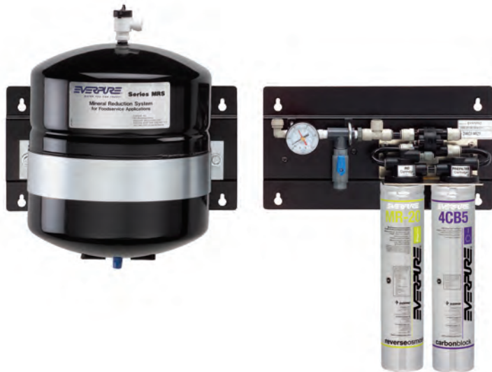
MRS-20 System: EV9797-91