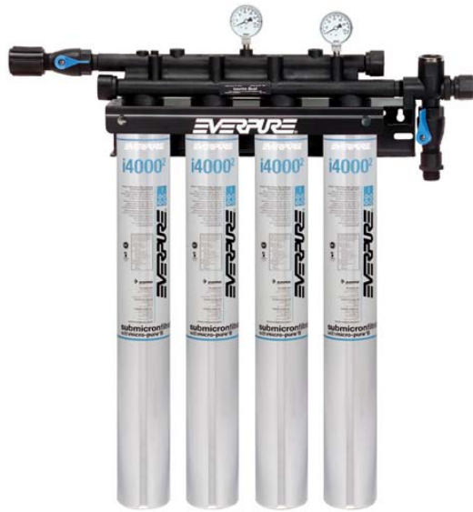
Insurice Quad-i4000 2 System: EV9325-04

Delivers premium quality water for ice applications