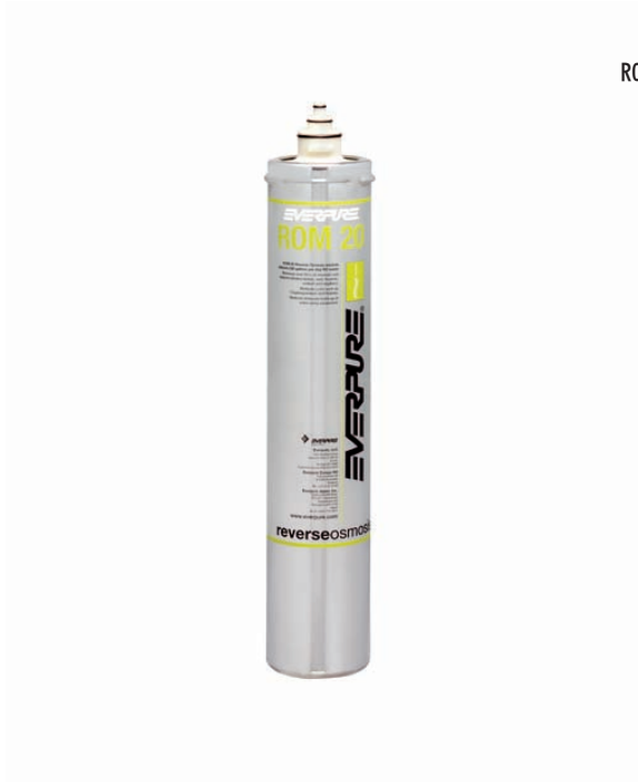
ROM 20 Replacement Cartridge: EV9273-93

Delivers premium quality water for office and vending applications