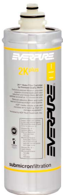
2K-Plus Replacement Cartridge: EV9612-61

Delivers premium quality water for foodservice, vending and OCS applications