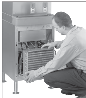
Icemaker in base slides out easily for service

Freestanding ice and water dispensers with air-or water-cooled icemaker located in the base of unit. Stainless steel frame and exterior with plastic trim. Water station standard. Up to 50 lbs (23kg) storage. Produces approximately 400 lbs (181kg) of compressed nugget ice in a 24-hour period