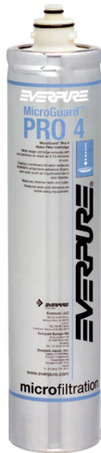
MicroGuard™ Pro 4 Replacement Cartridge: EV9637-02

Delivers premium quality drinking water for bottleless coolers and drinking fountains