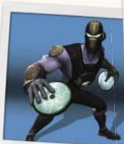
Disky - Avoid his sticking bombs at all costs.

Beware! There are lots of nasty villains who will try to stop you from completing your missions.