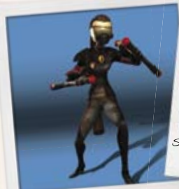
Praddy - Make sure to dodge her spears.