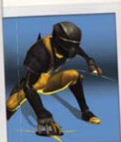
Starry - His ninja throwing stars can cause serious damage.