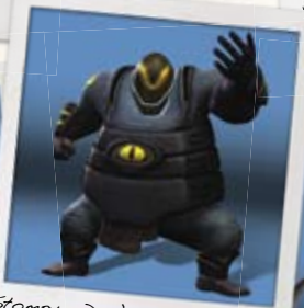
Stompy - Don't get stomped by his explosive boots.