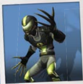
Glovey - Watch out for his swipe.