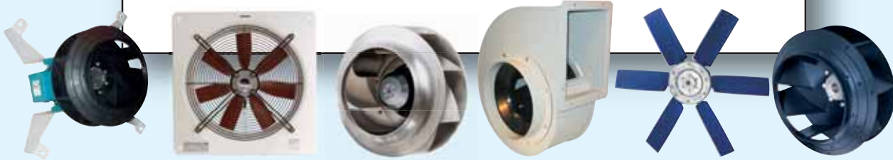
Cabinet Cooling Fans

The OEM Fan Division works closely with original equipment manufacturers to meet their design requirements, offering in-stock fan components, 3D models and custom fan solutions.