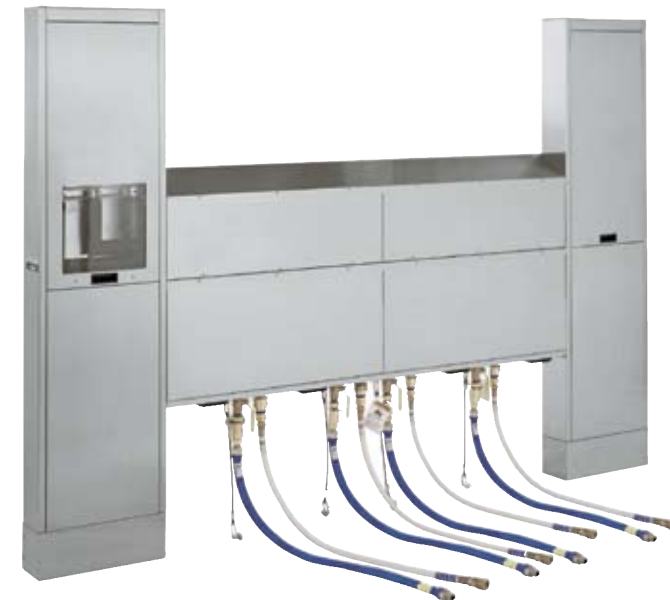
Modular Utility Distribution System