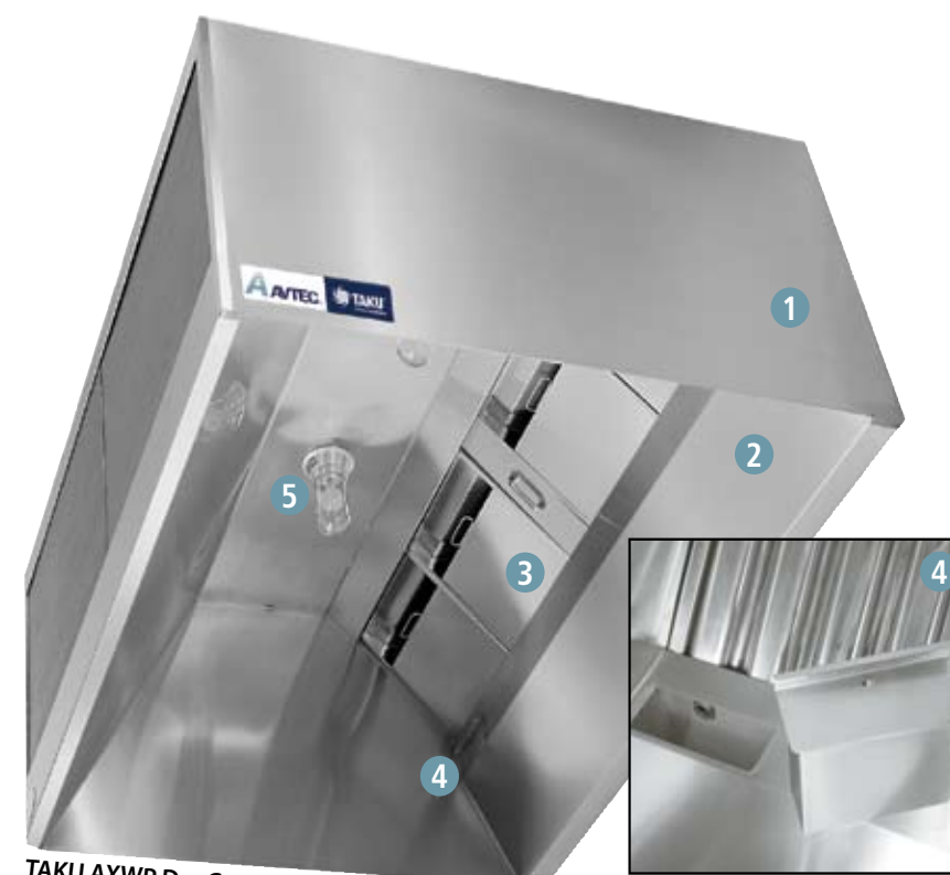
TAKU AXWP Dry Cartridge Perforated Front Hood

TAKU models feature heavy 300 series stainless steel throughout. Pre-wired, UL listed light fixtures are designed not to exceed three-feet on center, giving you the light you need. A concealed grease gutter and removable grease cup add to the pleasing aesthetics, as do stainless steel grease filters or modular grease extractor cartridges—as well as our popular programmable water wash system for applications that require the best available technology on the market. Adjustable location hanger brackets and built-in, three-inch rear air space are standard.