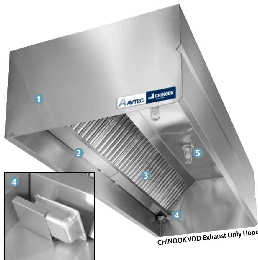
CHINOOK removable grease cup and trough for easy cleanup

The systems also feature pre-wired, UL-listed incandescent light fixtures, as well as aluminum grease filters, a removable grease trough and grease cup for easy cleanup, and built-in, three-inch rear air space. An optional zero-inch clearance is approved for use against combustible surfaces and is available on the top, back, or ends.