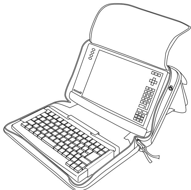
Figure 3. Assembled Stylistic LT in Portfolio Case