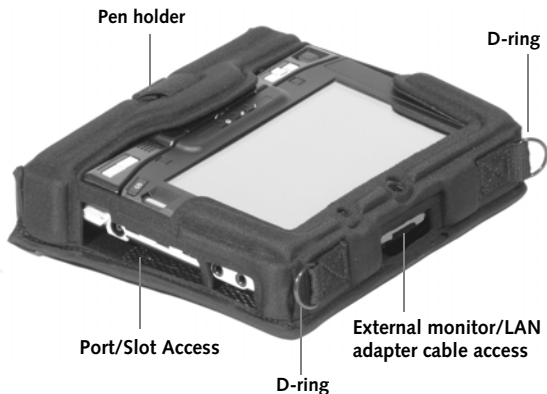
Figure 1. Bump case - Front

We strongly recommend that you read these instructions prior to using the bump case with your computer.