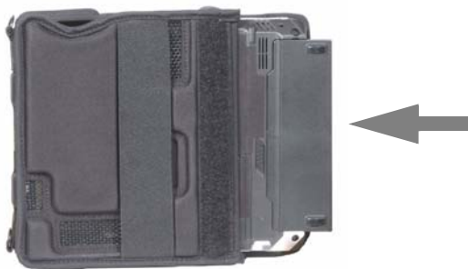
Figure 4. Inserting notebook into bump case (rear)