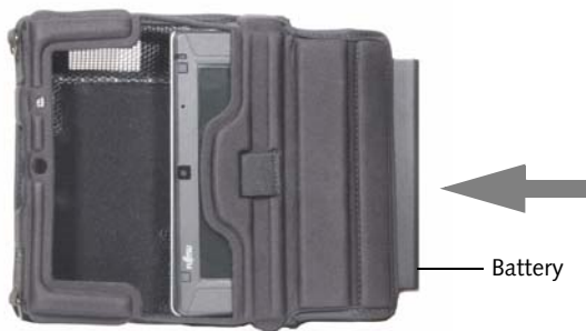
Figure 3. Inserting notebook into bump case (front)