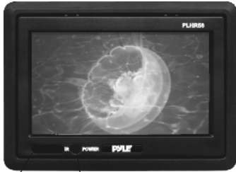
IR sensor Power