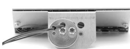
driver side(screws and mounting plate offset to the left)