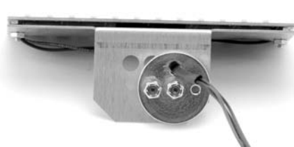
passenger side(screws and mounting plate offset to the right)