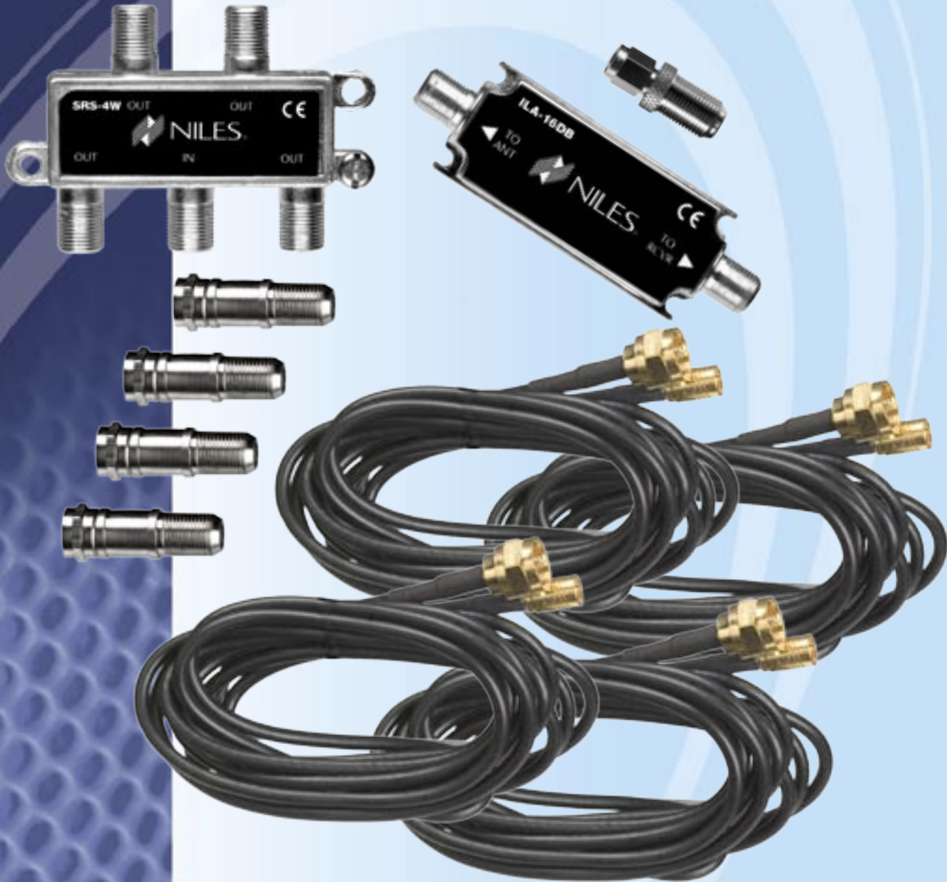
Installation Kit for Four (4) Satellite Radio Tuners