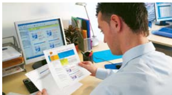
Without Web Print: information can be cut off and extra pages printed

For outstanding performance, with everything you need to improve your competitiveness, trust the business printing specialists to give you the edge.