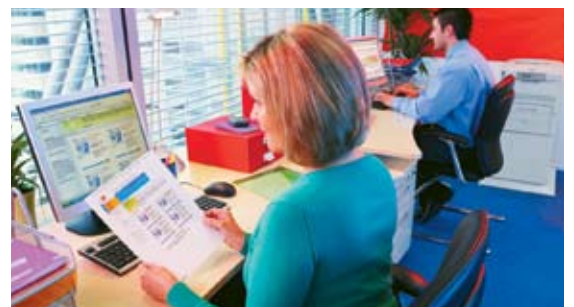
Web Print makes printing web pages easy, saving time & paper