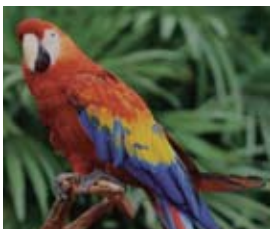
Without Photo Enhance