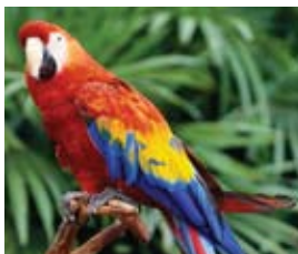
With Photo Enhance