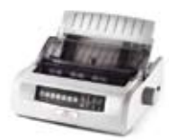
Dot Matrix Printers