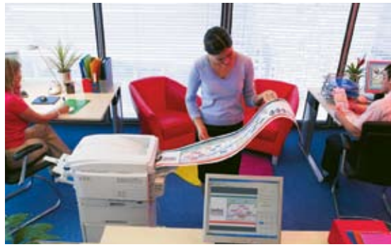
Media versatility – print up to 1.2m banners