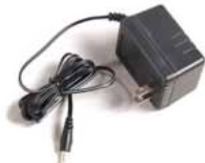
AC Power Adapter