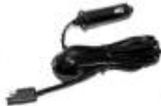
FIGURE 3 - DC CHARGER

Make sure the DC source (jump starter, battery pack, vehicle accessory socket, etc) is 12 volt DC. The DC source should be able to supply at least 10 amps at 12 volt DC.