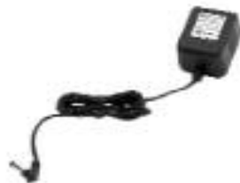
FIGURE 2 - AC CHARGER

WARNING: Use the supplied AC recharge adapter; do not substitute. AC recharging requires the use of the included AC charger/adapter that supplies 12 volts DC.