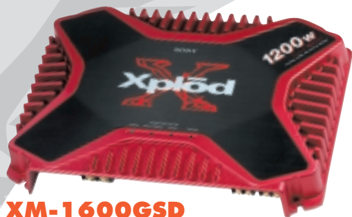
XM-1 600GSD Mono Class D Amplifier