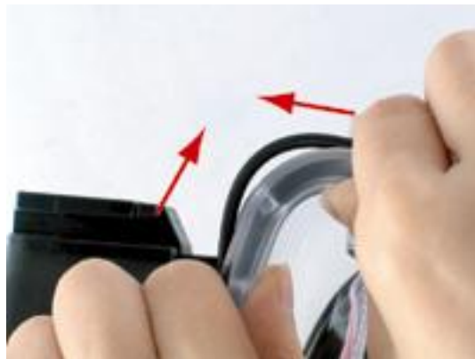
FIGURE 2: PROVIDING A LOOP IN THE GASKET