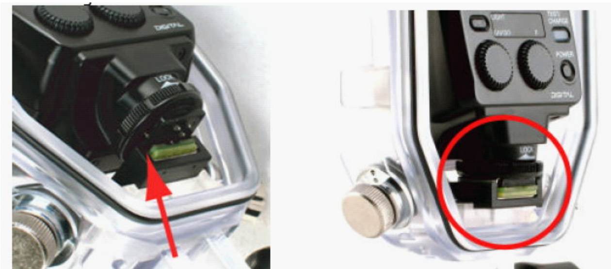
FIGURE 3: SLIDE IN AND LOCK THE FLASHLIGHT

Turn the lock ring follow the direction “LOCK”. Take care not to excessively tighten the screw. Note: If you find that control levers do not locate properly with the buttons, please check again that the flashlight is properly seated to the limit of the guide rail.