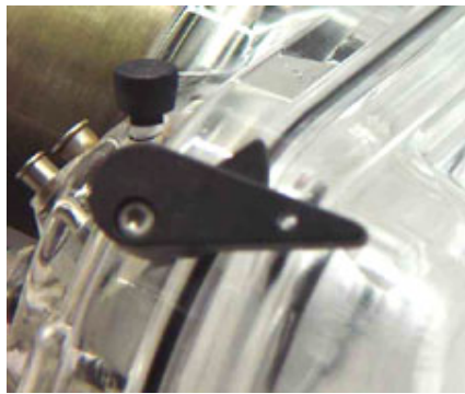
Cam Lever in Housing