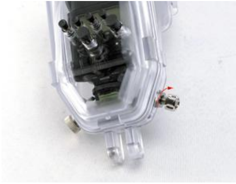
FIGURE 4: REPLACE THE LID