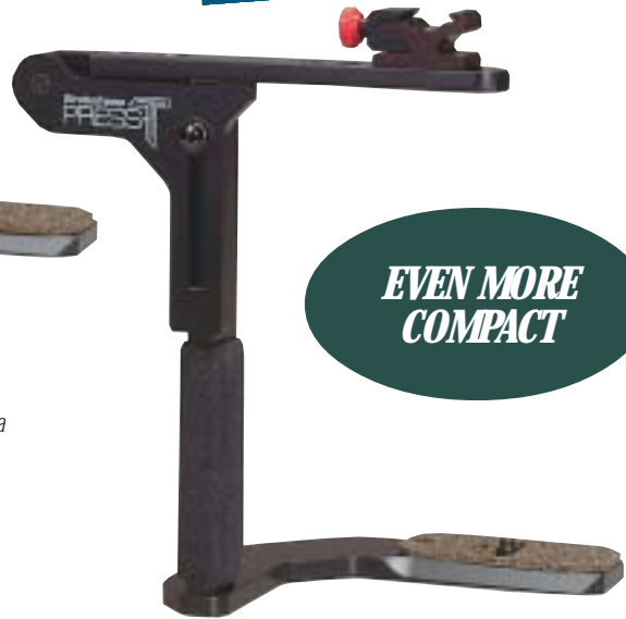
Brackets shown with optional flash mount (Shoe Mount 300-SHO)