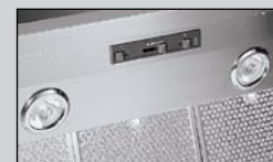
Two halogen lamps in 30", 35 1/8", 36" models; four lamps in all others.

Optional decorative soffit flue (see p. 50)