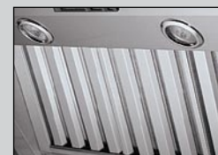
Optional stainless baffle filters complete the professional look.

Optional decorative flue shown here is available as an accessory