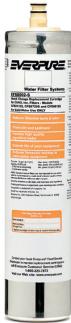
EFS8002-S Replacement Cartridge: EV9781-12

Replacement filter for Cuno® Series 8000 systems