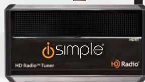
HD Radio™ Tuner (sold separately) Part #: HDRT