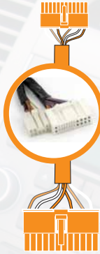
Media Gateway Harness Part #: PGHHY1