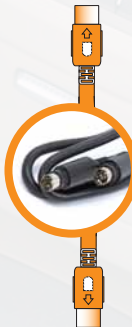
3Ft. HD Radio Cable (sold with HDRT)