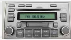
Factory Radio Not Included