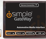
Media Gateway Part #: PXAMG