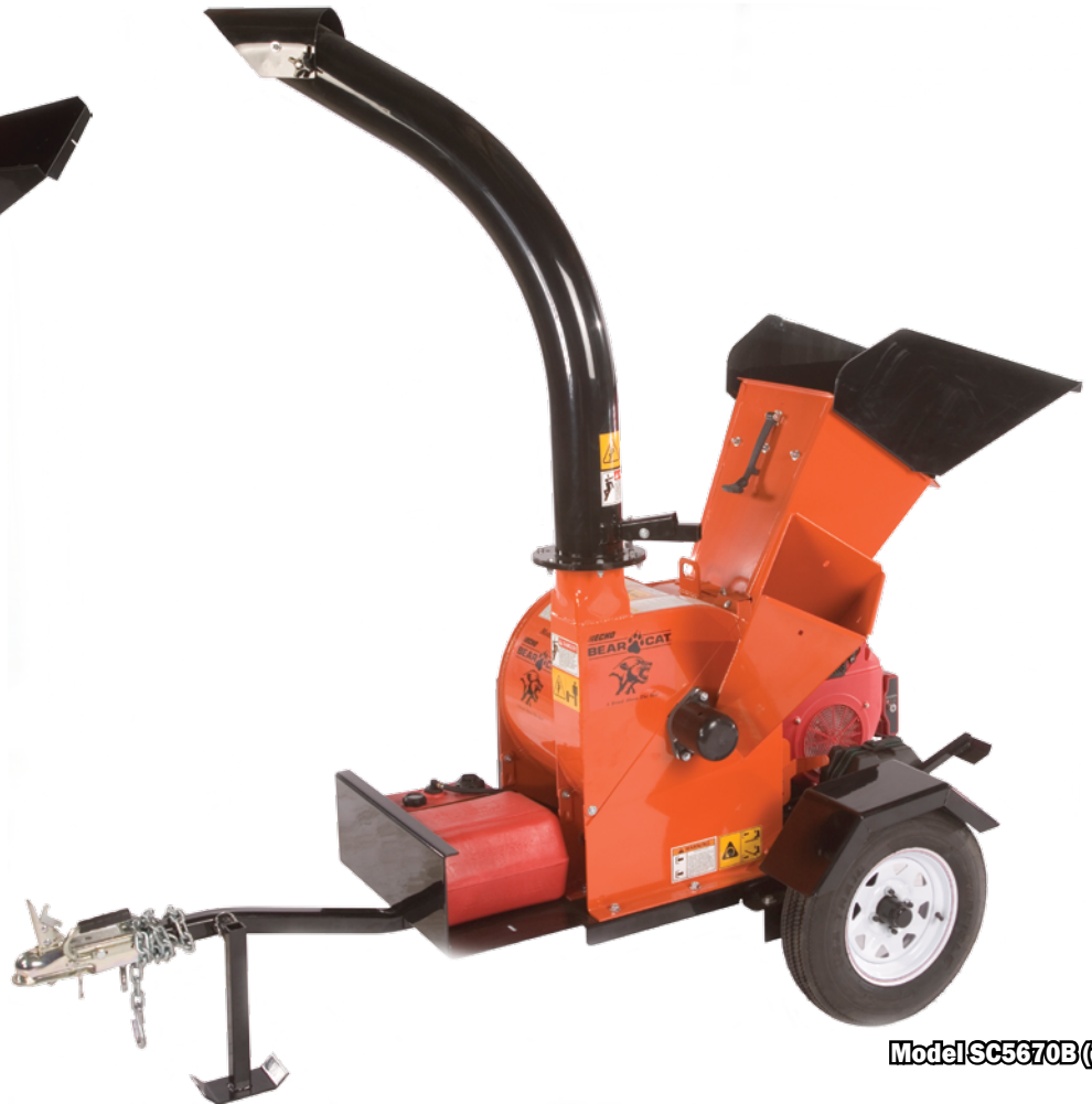
Model SC5670B (75524)

Easy access to rotor, blades and knives is provided by the large hinged cover with safety interlock.