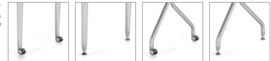
Tapered with Casters

Legs are available in two styles – Tapered and Spider and in two finishes in Silver (SI) or Black (BK). Choose from adjustable glides or locking casters.