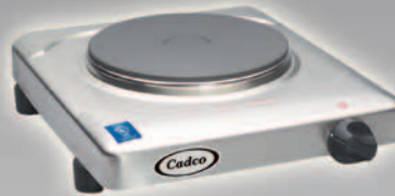
Model KR-S2: Cast Iron Range with Stainless Finish 7-1/8" element / 1500 watts