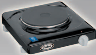
Model KR-1: Cast Iron Range with Black Enamel Finish 7-1/8" element / 1500 watts