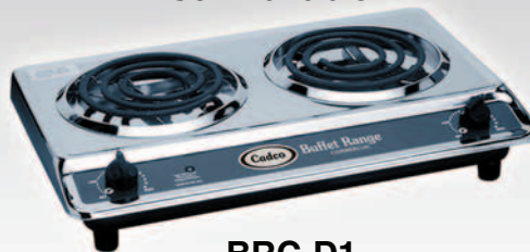
BRC-D1 Double Burner Buffet Range 825 Watts/burner; 1,650 Watts total