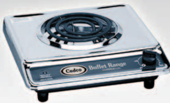
BRC-S1 Single Burner Buffet Range 1,100 Watts