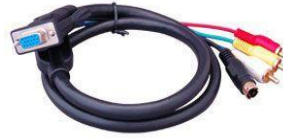
VGAF-SVRCAM (for player)