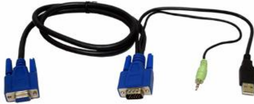
VGA + Audio + USB Power 3-in-1 cable for VGA-C5-S