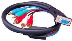
VGAF-HDTVM (for player)