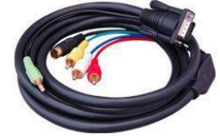
VGAM-SVRCAM (for monitor)

HDTV Cable Kit for Component Video + Audio (Sold Separately)