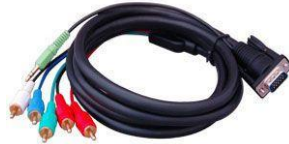
VGAM-HDTVM (for monitor)