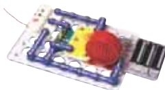
FM Radio Model SCP-02