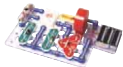
Musical Recorder Model SCP-01

Build over 750 projects, contains over 80 parts, and PC interface included.