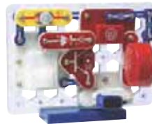
Motion Detector Model SCP-03