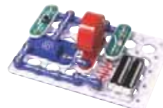
Music Box Model SCP-04