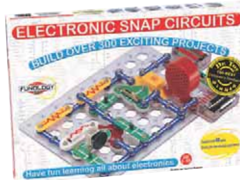
Snap Circuits Model SC-300

Build over 100 projects, contains over 30 parts.