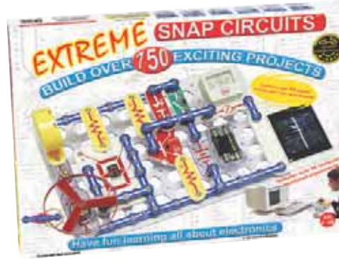
Snap Circuits Extreme Model SC-750

Build over 500 projects, contains over 75 parts.