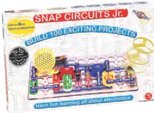
Snap Circuits Jr. Model SC-100

Contact Elenco® to find out where you can purchase these products.