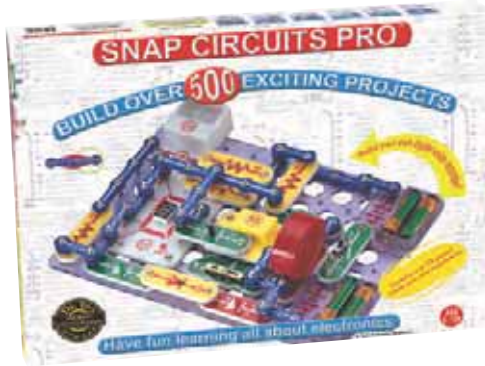
Snap Circuits Pro Model SC-500

Build over 300 projects, contains over 60 parts.