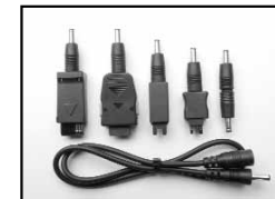
CELL PHONE CHARGING ADAPTER TIPS AND CORD