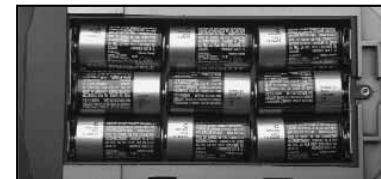
DRY CELL BATTERY COMPARTMENT (BOTTOM OF UNIT)