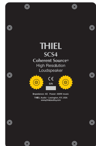
Rear input panel

The speakers should be connected to the amplifier with high quality cable to ensure minimal loss of power and proper control by the amplifier. If the speakers are being connected to a vacuum tube amplifier with various impedance taps, the 4 ohm tap will usually give the best results.