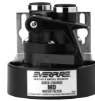
MD Single Head P/N 169110 (1 Pack) Replaces P/N EV927401 Designed for use with MD-HN & MD-HE filter cartridges.