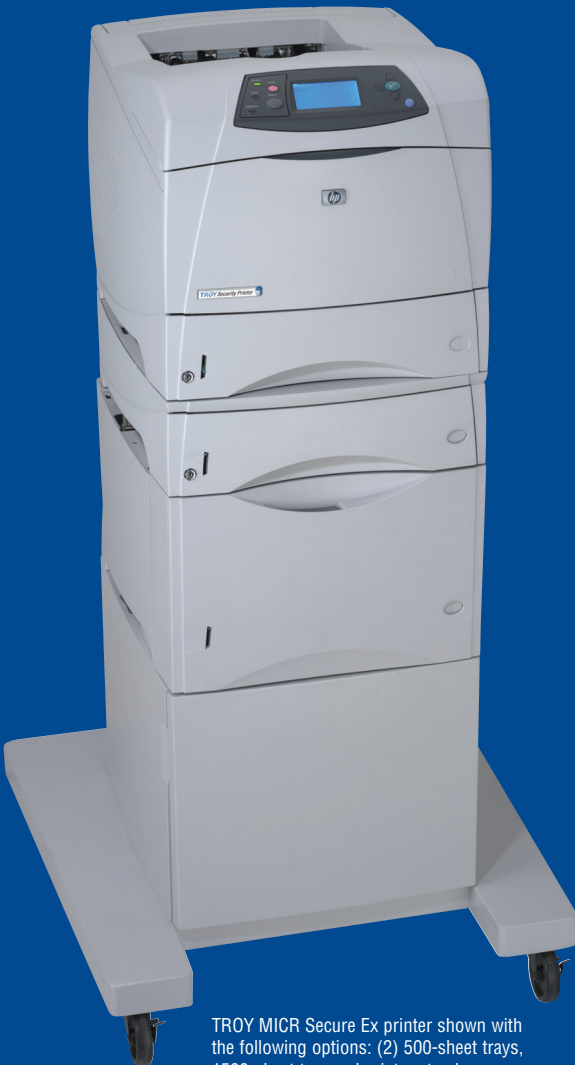
TROY MICR Secure Ex printer shown with the following options: (2) 500-sheet trays, 1500-sheet tray and printer stand.