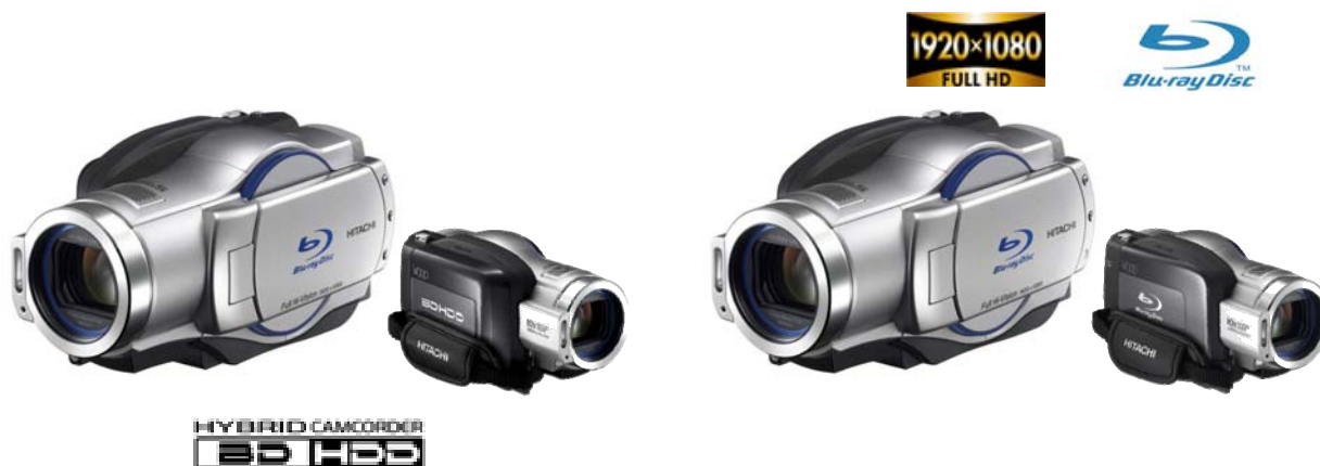
8cmBD/DVD Drive+30GB HDD Cam DZ-BD7H