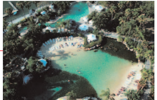
Wide angle using 0.6x wide attachment

The MV700 series' sound technology matches its imaging technology, with newly-designed AIF4 bringing superb aural clarity to your movie masterpieces.