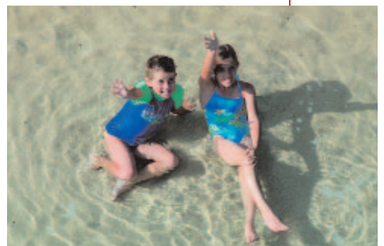
Zoom mode 22x