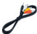
STV-250N Mini Plug to RCA Used to connect to a TV or VCR.