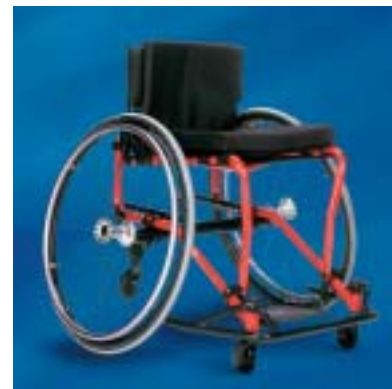
The Invacare® Transformer™ shown with removable offensive wing.