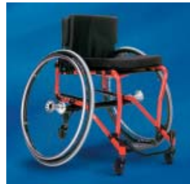
The Invacare® Transformer™ shown with removable bumper.