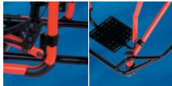
Adjustable rear seat height.