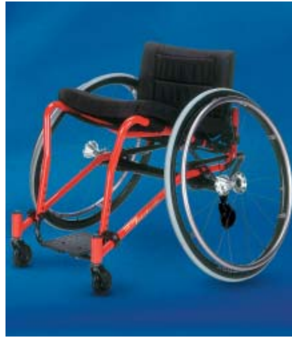
Invacare® Top End® Transformer™ shown with wing/bumper removed.