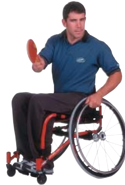
Play Table Tennis