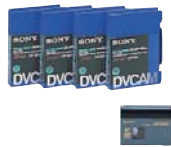
PDVM-12ME/22ME/32ME/40ME Digital Videocassette (Mini size)