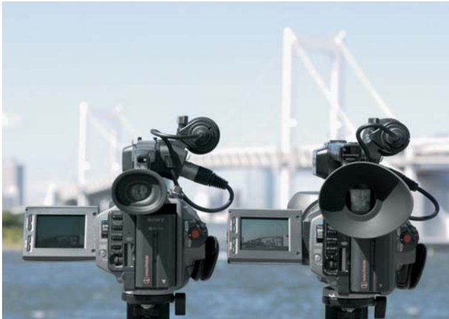
Comparison of images displayed on the LCD monitors of the DSR-PD150 on the left and DSR-PD170 on the right

The DSR-PD170 has a high-resolution color LCD monitor for viewing the recorded picture, or checking the playback picture on location. With its large screen, it is also helpful in setting menus or the audio recording level, as well as monitoring the camera and audio status while mounted on a tripod. The hybrid LCD monitor combines the characteristics of both transmissive and reflective LCD panels. The transmissive LCD panel is suited for dark conditions such as in the studio, while the reflective LCD panel provides clear viewing in bright conditions such as under strong sunlight.