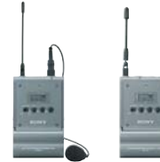
UWP-C1 UHF Synthesized Wireless Microphone Package