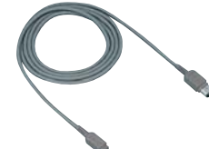
VMC-IL4615/IL4635 (4-pin to 6-pin, 1.5 m/3.5 m) i.LINK Cable