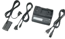
AC-V700A AC Adaptor/Charger