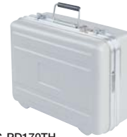
LC-PD170TH Hard Carrying Case for DSR-PD170/PD170P