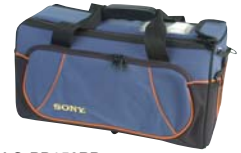
LC-PD150BP Soft Carrying Case for DSR-PD170/PD170P