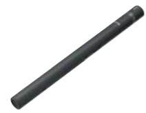
ECM-670/672/678 Electret Condenser Microphone (CAC-12 Camera Microphone Holder is required)