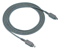
VMC-IL4408A/IL4415/IL4435 (4-pin to 4-pin, 0.8 m/1.5 m/3.5 m) i.LINK Cable