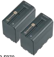
2NP-F970 InfoLITHIUM Rechargeable Battery Pack

Some of the following accessories may not be available in certain countries. For details, please contact your nearest Sony office.