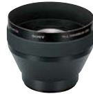
VCL-HG1758 Tele Conversion Lens 1.7x