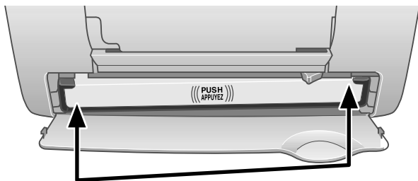
If either side of the photo cartridge sticks out, the cartridge is installed incorrectly.

If the photo cartridge is crooked, release the lever, then remove the cartridge and reinstall it following the instructions on the Start Here poster.